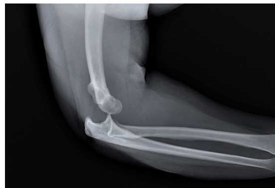
X-ray of a dislocated elbow

A hand therapist will work closely with the surgeon to help treat a terrible triad injury. The hand therapist may make an elbow orthosis to support and protect the elbow. The therapist will also educate the patient on how to reduce swelling, decrease pain and safely improve range of motion and strength of the elbow.